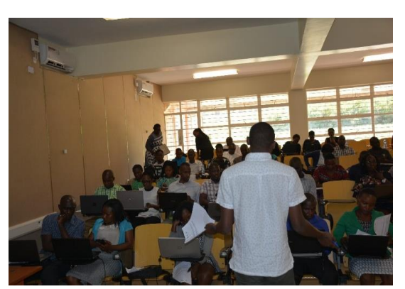
Training REC administrators and IT personnel at the Busitema main Campus

The project implemented by UNCST and partners; Buistema University and Mbale Regional Referral Hospital is building on the achievements of CREDU with a view to making UNCST a centre of excellence for research ethics in the Eastern Africa region. It has trained 25 RECs on the use of NRIMS, online review and equipped them RECs with the requisite equipment and Internet connectivity. Through the training programme, SCRECU has empowered the REC institutions and other stakeholders with well-qualified REC administrators through capacity building and skills.